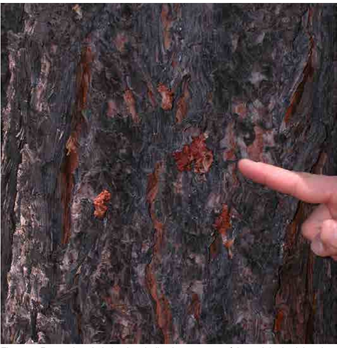
Figure 5. Rust-colored pitch tubes indicating a successful attack by bark beetles.