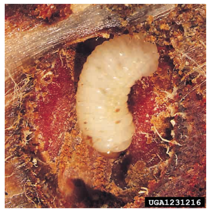
Figure 4. Larva inside gallery.