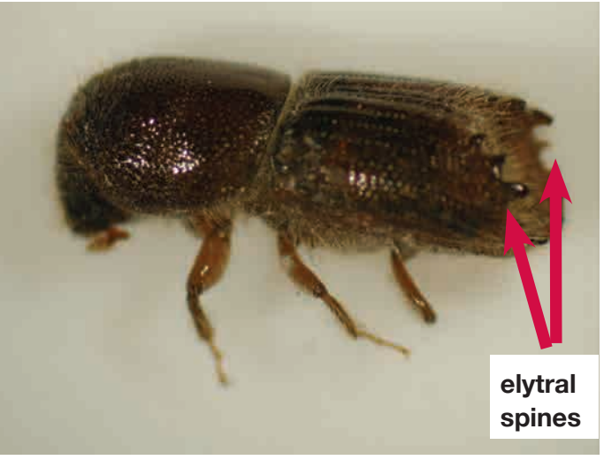
Figure 2. Adult piñon ips.

(one to two miles maximum) seeking a susceptible tree. These bark beetles normally infest stressed, damaged and dying trees. They will also infest recently cut piñons and the slash associated with firewood harvesting or thinning practices during spring, summer, and fall. If enough beetles are produced by these practices, they can infest green standing trees. Once the wood has dried sufficiently and the bark is easy to pry off, it is no longer suitable for bark beetle colonization.