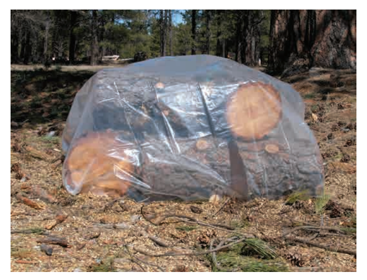
Figure 6. Firewood placed in the full sun and covered with plastic sealed along the ground.

(woodborers — large white segmented larvae or large beetles, some with long antennae) are commonly found in dead trees but they are generally not a threat to live trees.