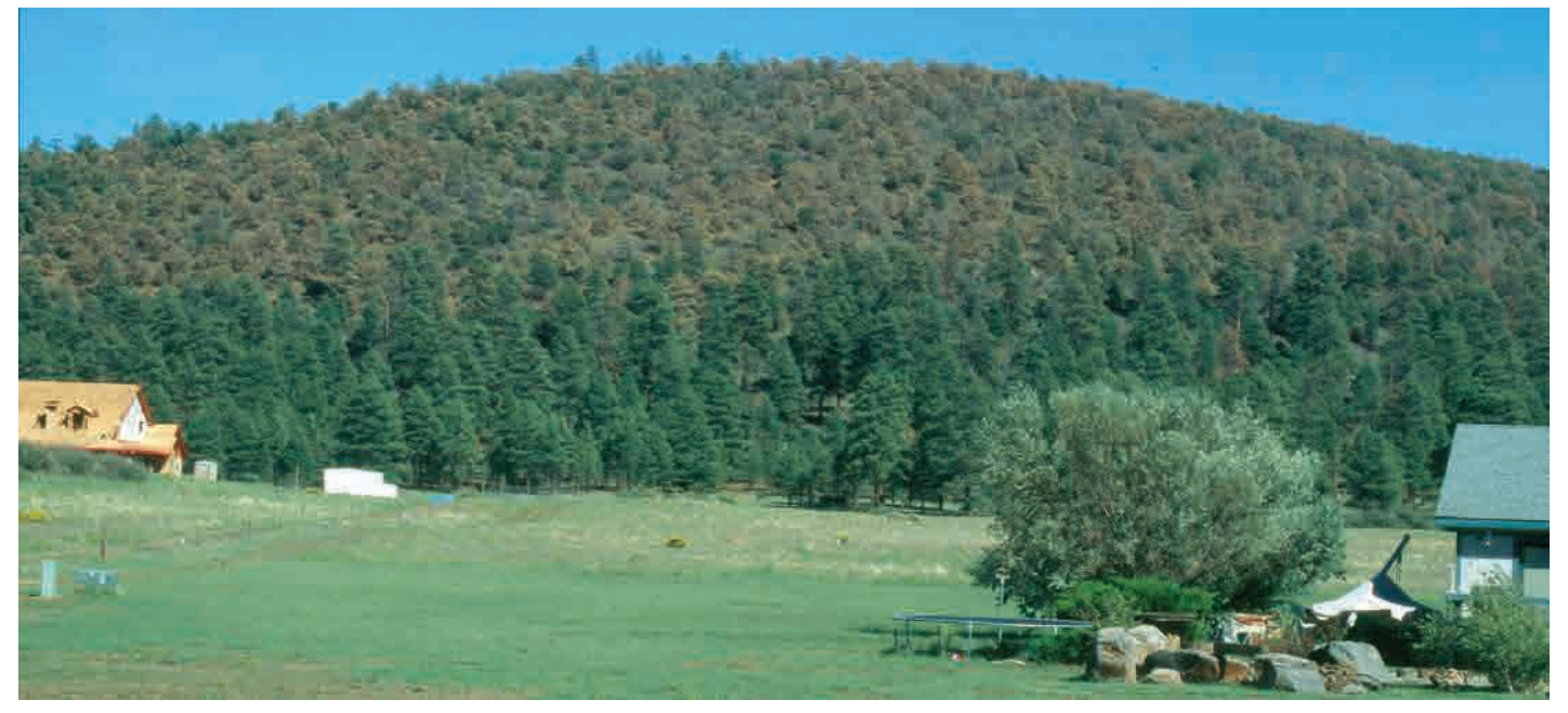
Figure 1. Extensive piñon mortality from piñon ips induced by drought conditions, Flagstaff, Arizona September, 2003.

Within the woodlands of 4,500' to 7,000' elevations in the Southwest, piñon pine occurs in association with juniper (Juniperus spp.) at the lower and ponderosa pine (Pinus ponderosa ) at the higher elevations. Piñon are commonly utilized by a small bark beetle - piñon ips, Ips confusus. Since these beetles are from the Ips genus of bark beetles they are also known as engraver beetles. Piñon ips will utilize, Colorado piñon (P. edulis) and single leaf piñon (P. monophylla) and occasionally other pines in the Southwest. Juniper and ponderosa species that are generally associated with piñon are not affected by piñon ips. Junipers in these woodlands are attacked by cedar, cypress, or juniper bark beetles in the Phloeosinus genus and woodborers. Ponderosa pine is attacked by pine bark beetles in the genus Ips and Dendroctonus. For information on these insects refer to University of Arizona publications AZ1316 "Cypress Bark Beetles" and AZ1300 "Pine Bark Beetles".