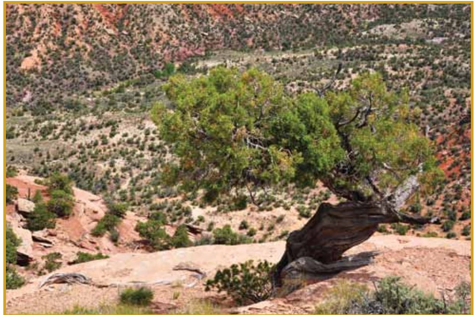
Figure 11: A juniper tree in the Colorado National Monument.

For more information or professional assistance in managing your forest, contact your local Colorado State Forest Service district office.